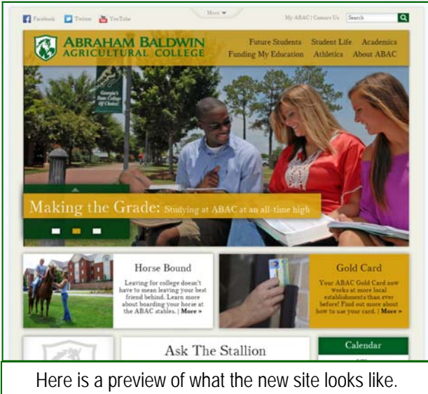
Here is a preview of what the new site looks like.

The time has come to start preparing for the website launch. The new site will launch February 3. Prior to that date the information and links on your current faculty pages will need to be moved over. After Feb. 2 all information on the current website will no longer be accessible to you, so it is very important to move your information before the new website launches.