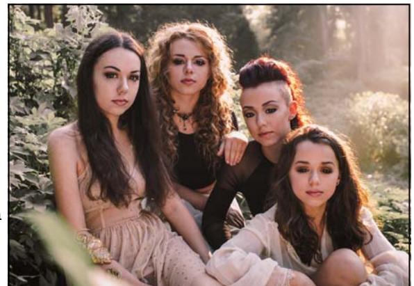
Foundation Scholars' program offers them a tremendous incentive to choose ABAC."

"The Foundation Scholars are some of the top academic students from area high schools," Snow said. "They have a lot of choices as far as colleges but the