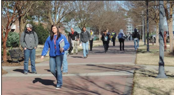
With 3,137 students, the spring term enrollment at ABAC is over six percent higher than the 2013 enrollment figure making this the second consecutive semester enrollment has increased.

A total of 232 students received ABAC diplomas at the end of the 2013 fall se-