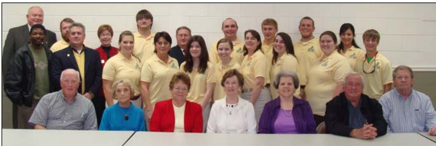
Telfair County officials and the ABAC Rural Studies students gathered for a picture after the presentations on projects which could help the county.