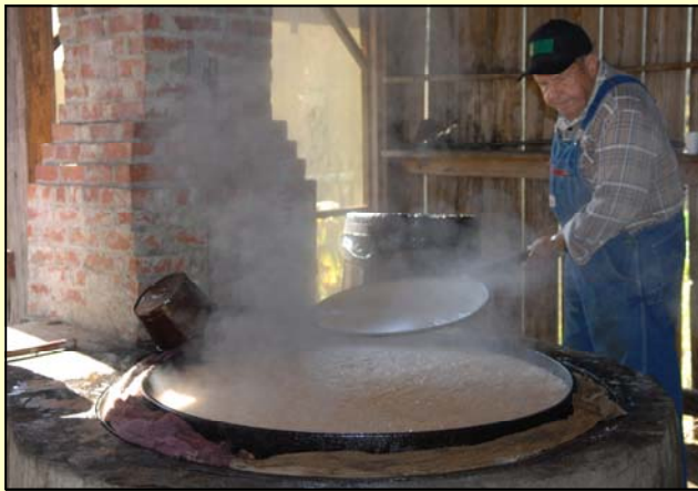
Cane Grinding will be one of the featured activities this Saturday at the Museum as part of the Victorian Christmas Celebration.

apple cider, pound cake and tea cake samples. Fresh cut Christmas trees will be available for sale from Brumby and White Christmas Tree Farm. Other events include farm fresh produce for sale with an emphasis on winter crops, cane grinding, Bobbin lace-making in the Tift House, pony rides and a petting zoo.