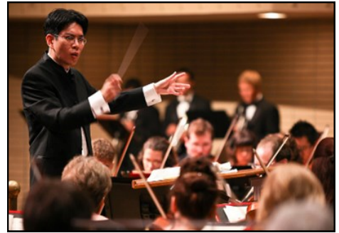
Valdosta Symphony Orchestra Sunday, September 16 at Tift Co. Performing Arts Center.

tickets for each event are $15 each for adults and $10 each for students under 18 years of age.