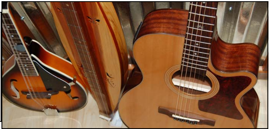
Exhibit hours for the month of August will coincide with the Museum's hours which are Thursdays, Fridays and Saturdays from 10 a.m. until 3 p.m. For more information visit www.abac.edu/museum