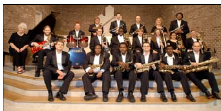
ABAC Jazz Ensemble

Screven County kicks off the day at 10 a.m. followed by Tift County at 10:30 a.m., Northside (Warner Robins) at 11 a.m., Colquitt County at 11:30 a.m., Val-