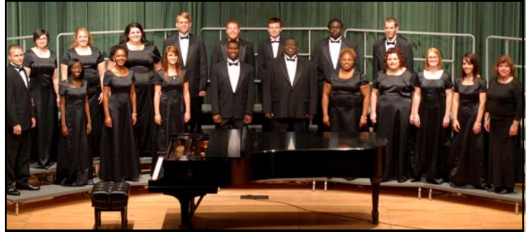
The ABAC Jazz Choir and Jazz Band will be the featured performers at 'An Evening for ABAC' on March 6. Call 391-4900 for info.