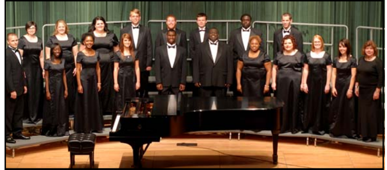
The ABAC Jazz Choir and Jazz Band will be the featured performers at 'An Evening for ABAC' on March 6. Call 391-4900 for info.