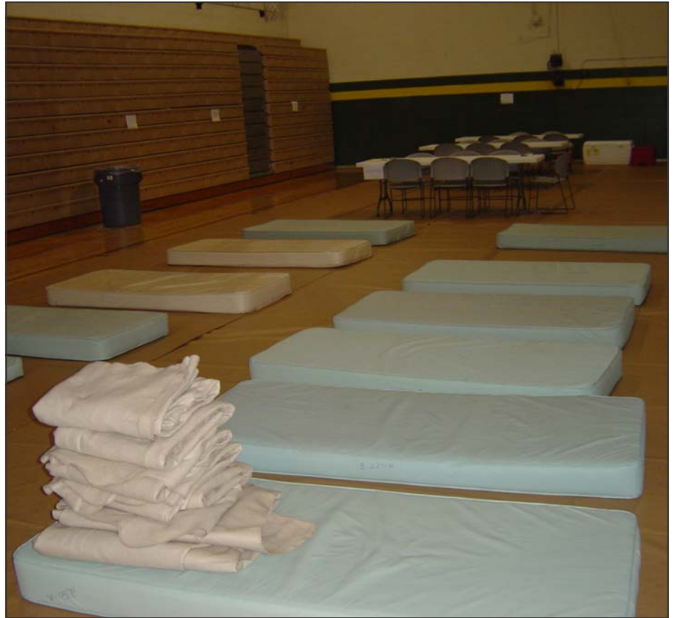
Gressette Gym was the primary Red Cross shelter in Tifton during Hurricane Frances. Over 50 persons stayed in the shelter during the weekend.

The concert will feature all types of music from Chopin to Berlin. There is no charge to attend.