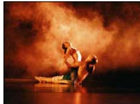
The Koresh Dance Company

the season subscription for seven performances for $50 for adults, $15 for students under the age of 18 and free for ABAC students. Single event tickets are $20 for adults and $15 for students. Call 386-3558 or go to www.southgaarts.com for details.