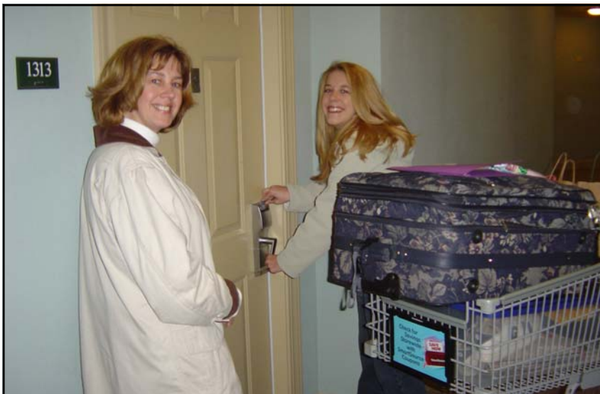
Using WebRoomz should help eliminate many surprises about roommates for students moving into ABAC Place when fall semester begins

Since 2001, WebRoomz has been providing unique housing management solutions for higher education. Similar to Internet airline reservations, after a student completes the room and