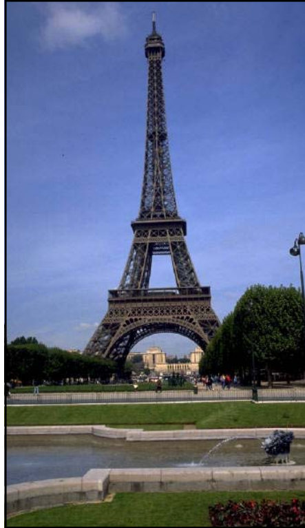
PSBOC travelers will visit the Eiffel Tower while in Paris this summer

In France, tourists can connect with American history on the D-Day beaches, where Allied troops invaded