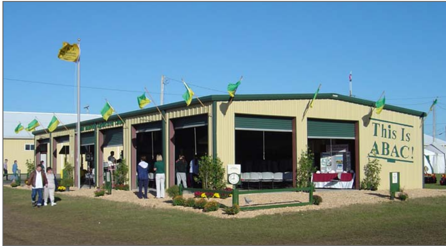
ABAC is this year's featured exhibitor at the Sunbelt Expo at Spence Field