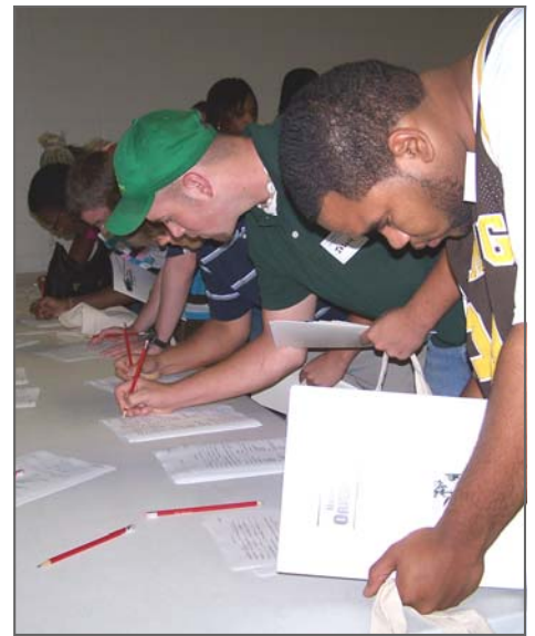
Large crowds are expected on Thursday and Friday for the final orientation and registration before fall semester classes begin.

Registration for other new and returning students will take place on Friday beginning at 9 a.m. This applies to all returning students who did not pre-register in spring, new students needing to register, and students who have to take placement tests on Thursday.