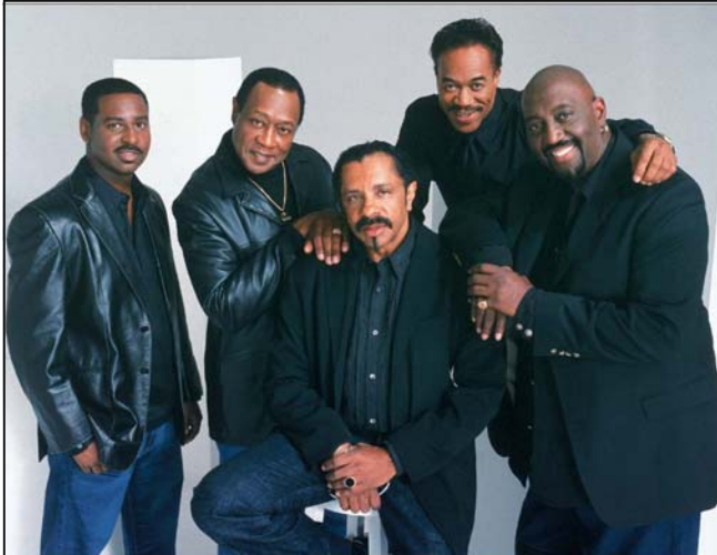
The Temptations will be on stage at ABAC on May 20

Unlike most scholarships, proceeds from this event go to those scholar-