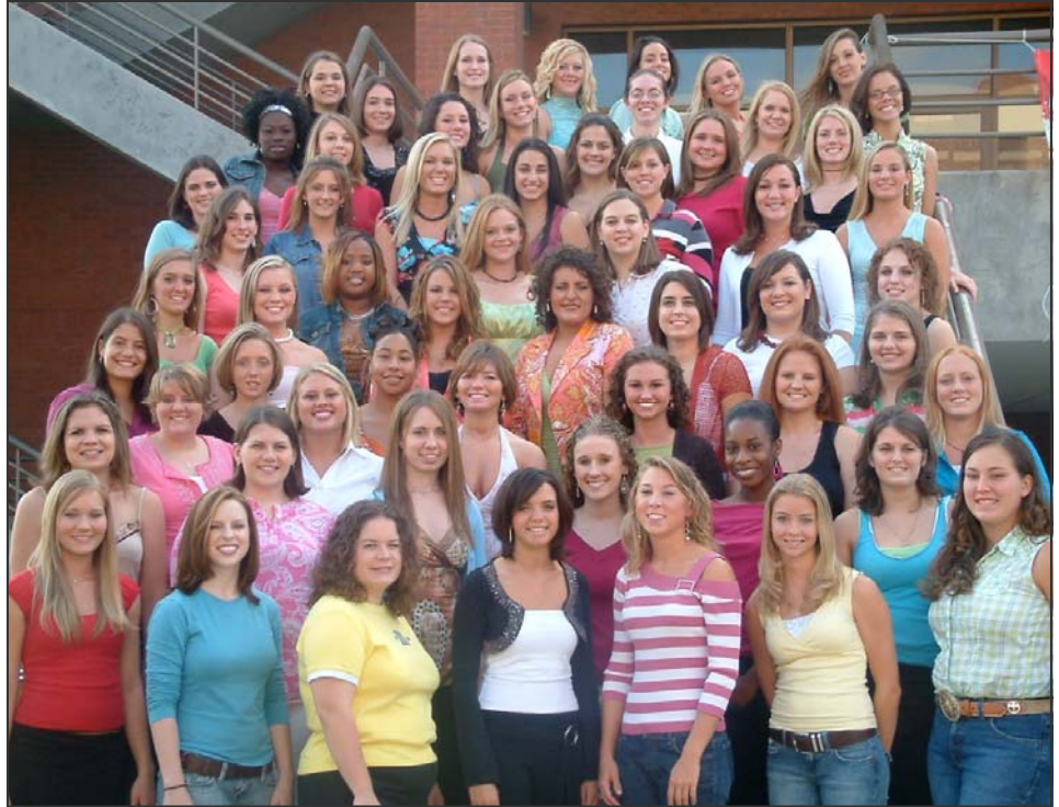
Fifty-six contestants will vie for the title of Ms. ABAC 2006 on Tuesday evening.