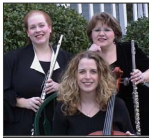
The Mannheim Trio