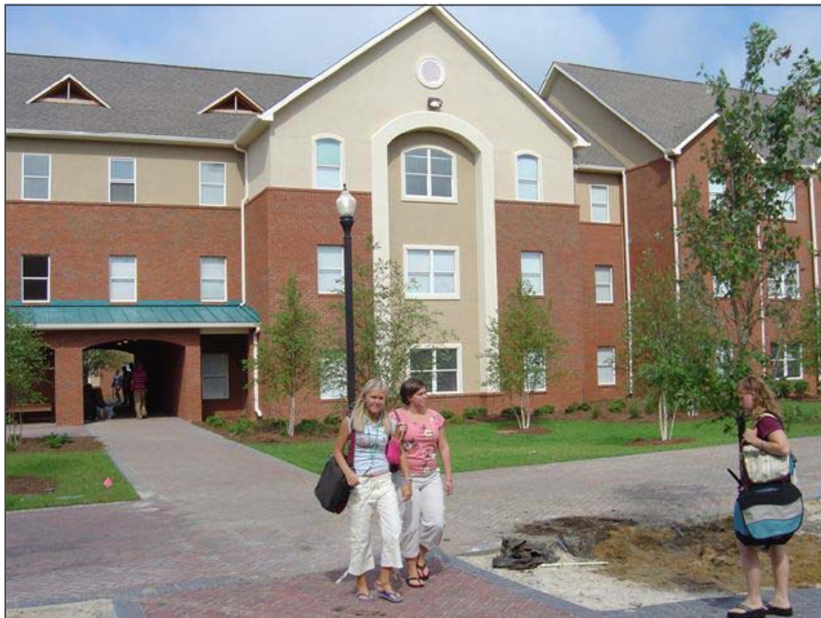
Residents of ABAC Place stroll down the Mall en route to classes.