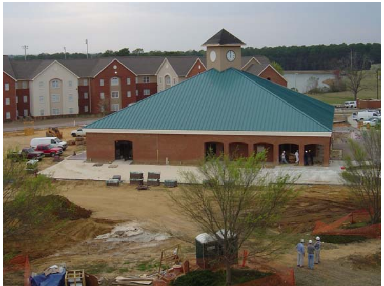
Go by and see the very impressive Town Hall at ABAC Place

ABAC Place will be an 835 bed state-of-the-art facility that will provide hi-tech resources along with all the comforts of home. Each apartment is fully furnished with finished kitchens that include all major appliances. Every bedroom has a full size bed, a built in desk with shelves and a two-position