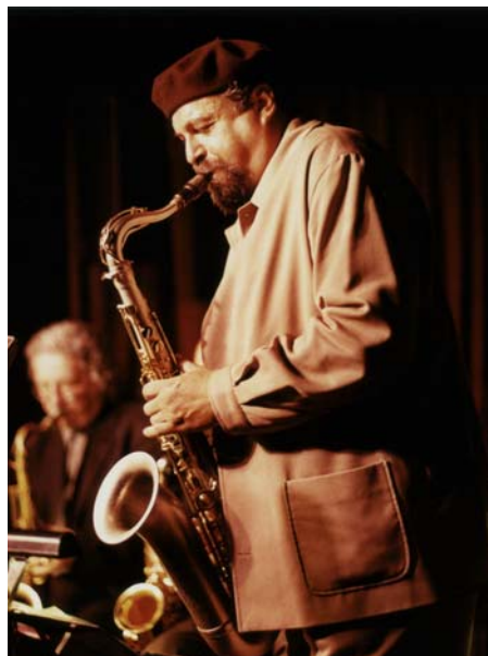
Jazz saxophonist Joe Lovano

Lovano has been named Musician of the Year by jazz magazines throughout the last 10 years. He embellishes jazz standards with his unique style and renders his own compositions with frequent variations of instruments in-