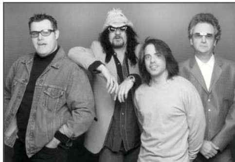
The Georgia Satellites

The music will be jamming in Fulwood Park on May 1, with the Love Affair Fine Arts Festival Picnic Concert. The featured band this year is The Georgia Satellites playing its #2 Billboard chart hit, "Keep Your Hands to Yourself" and other southern rock music. Also appearing on stage will be Conch Republic offering Jimmy Buffet songs and other island tunes.