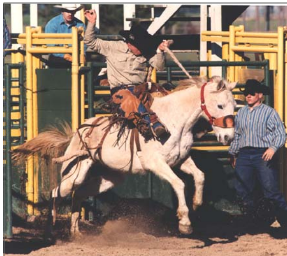
Professional Cowboys Association members will compete this weekend at the ABAC Arena

Spectators can take part in a steer dressing or pig wheeling contest for a fee of $10, as well as try their luck on the mechanical bull.