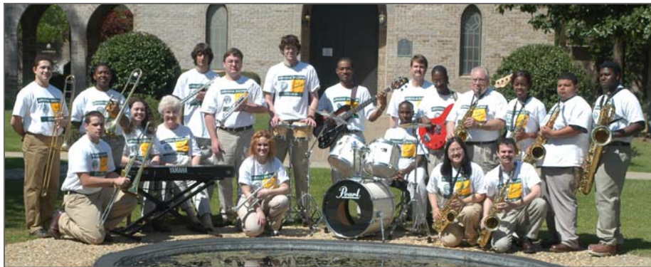
The ABAC Jazz Ensemble will perform as part of the Music Program's Spring Concert on April 8 in Howard Auditorium. There is no charge for the event.