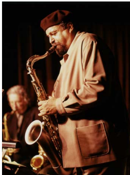
Jazz saxophonist Joe Lovano

Lovano has been named Musician of the Year by jazz magazines throughout the last 10 years. He embellishes jazz standards with his unique style and renders his own compositions with frequent variations of instruments in-