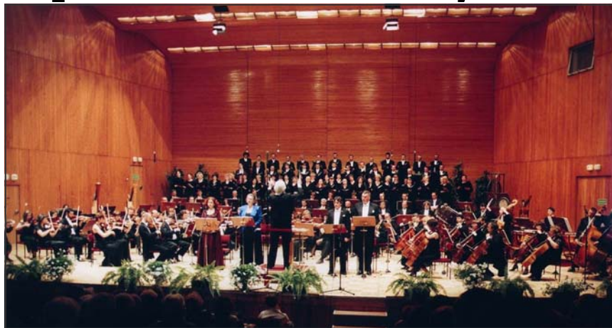
The Polish Philharmonic Resovia

This 48 member orchestra is known throughout Europe for its magnificent performances at cultural festivals along with great concerts in its own Artur Malawski National Philharmonic Hall. In their concert, these musicians skillfully present classics by Bach, Mozart, Beethoven, and Chopin as well as pieces from composers of their home-