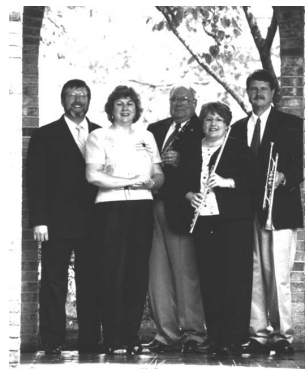
ABAC Music Faculty